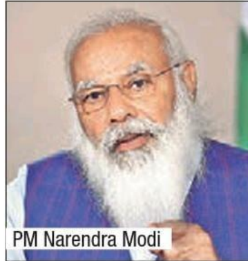
PM Narendra Modi